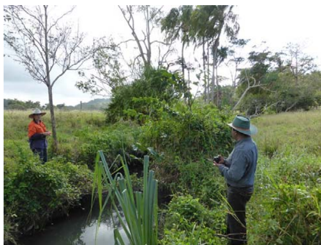
BIOSECURITY QLD AND MACKAY REGIONAL COUNCIL OFFICERS IDENTIFY POND APPLE REGROWING IN THE TARGET CATCHMENT - JUNE 2014

This project aims to eradicate weeds (Pond Apple Annona glabra and Rubber Vine Cryptostegia grandiflora ) impacting on high quality agricultural land and environmental assets within the Mackay Whitsunday Region. Pond Apple and Rubber Vine pose significant environmental threats to the Region and are considered to be one of the highest priority pests under the Mackay Regional Pest Management Plan and State Legislation.