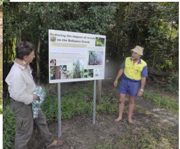
UNVEILING SITE SIGNAGE AT A COMMUNITY WORKING BEE MAY 2014, RELIANCE CREEK

Management Plans have been delivered to eight target landholders in the neighbourhood, with around ten other community members engaged about weed management in general. Milestones for the current year of the project have been met, with 1100 local native plants installed at a community engagement event and field walk day in November 2013. Another community engagement day and working bee was held in May 2014, with a further 150 plants planted, and a site sign unveiled.