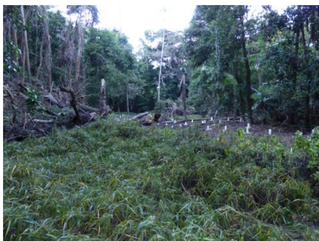
STAGE 1 RUELLIA TREATMENT SUBJECT TO REVEGETATION (BACKGROUND) WITH STAGE 2 NEWLY TREATED IN APRIL 2014 (FOREGROUND)

Revegetation follow-up monitoring and maintenance has continued into 2014.