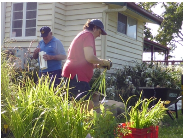
MARIAN COMMUNITY WORKING GROUP MEMBERS AT A WORKING BEE