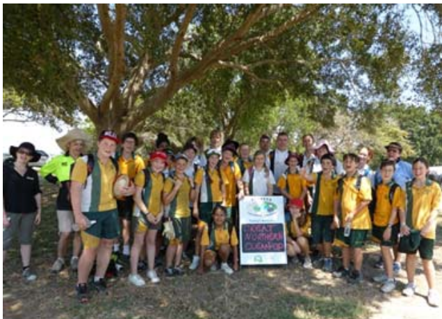
FIFTY-ONE STUDENTS FROM TWO SCHOOLS AT THE GREAT NORTHERN CLEAN UP

Mackay Coastal Clean-up in October also achieved amazing results with Pioneer Catchment and Landcare sponsoring a community event at Far Beach on 27 October. Over 50 volunteers worked alongside the Eco-Barge team from Airlie Beach collecting over 4,000kg of rubbish along the stretch of beach from Illawong to the Town Beach area.