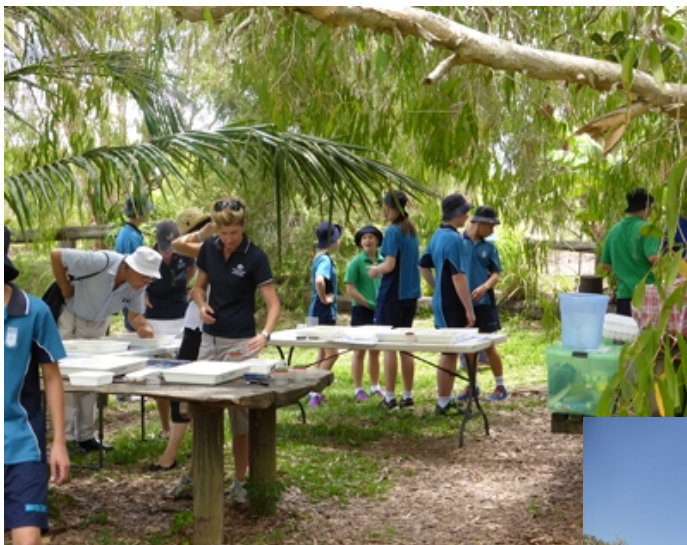
REEF GUARDIAN SCHOOLS ACTIVITY AT WETLANDS WALKABOUT