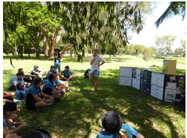
OUTDOOR EDUCATION WITH CONSERVATION PARTNERS AT FAR BEACH