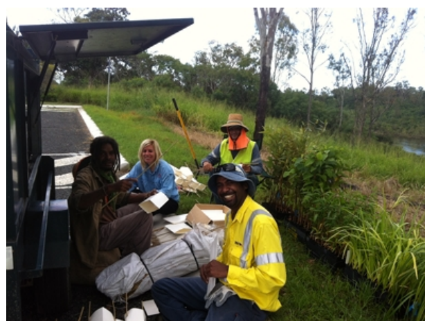
WORKING WITH CONSERVATION VOLUNTEERS AUSTRALIA ON A PROJECT SITE

Pioneer Catchment & Landcare continued to provide support where possible to community groups including Marian Community Working Group, the Friends of the Morag McNichol Reserve, the Friends of MacKillop Wetlands.