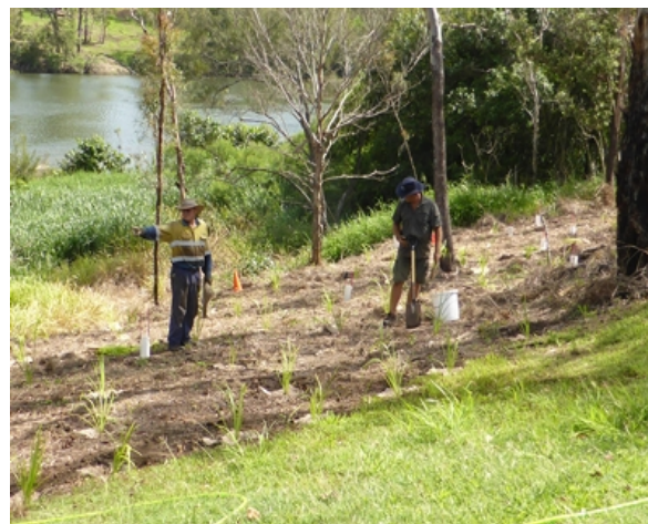
REVEGETATION WORKING BEE AT PIONEER RIVERBANK, MARIAN

Extensive weed control and revegetation occurred at this site this year. Conservation Volunteers Australia and contractors cut stumped Leucaena ( Leucaena leucacephala subsp. leucacephala ) and foliar sprayed Guinea Grass ( Megathyrsus maximus var. maximus ) and prepared the area for revegetation with 600 local native plants. Other weeds include vines and sensitive weed, along with the discovery of Guava, Singapore Daisy and Castor Oil Plant, made weed control more complex than planned. As well, thousands of little Leucaena plants continue to come up even after the planting season. The final planting site (400 specimens) is under preparation, with a plan to burn out Leucaena stems to assist access and ongoing maintenance.