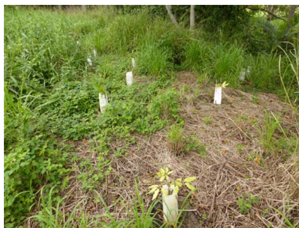
EXTENDED AREA OF RIPARIAN REVEGETATION UNDER THE POND APPLE CONTROL PROJECT