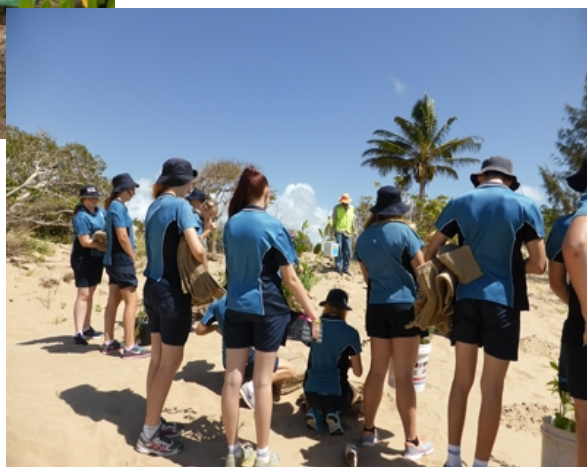
MERCY COLLEGE STUDENTS HELP OUT AT FAR BEACH REVEGETATION PROJECT