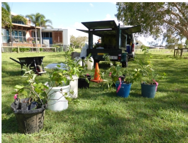
REVEGETATION AT FAR BEACH IN FULL SWING

750 plants have been planted at the site, although some major losses were experienced due to cyclones early in 2014. A number of engagement opportunities with Mercy College High School students were a feature for the year. The students helped with 2 clean-up events, planted 200 plants and learnt about coastal management issues at an integrated outdoor education session with Mackay Turtle Watch, Great Barrier Reef Marine Park Authority, Reef Catchments and Mackay Conservation Group.