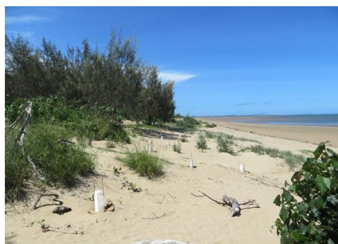
Image: Reveg planting at Far Beach

CVA teams helped to maintain the Far Beach site with watering and weed management. Maintenance work was commenced by Mackay Green Solutions who also did the plantings in January. Council teams tidied the site in preparation for the field trip in February, which was attended by 25 colleagues in coastal vegetation management, Landcare volunteers and community members. Field trip participants visited Sandfly Creek to view completed works on the habitat. PCL is grateful to Mackay Regional Council and Birdlife Mackay for sharing information with field trip attendees.