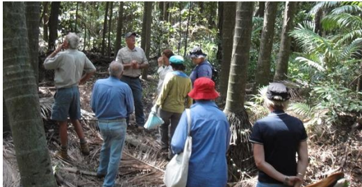
Image: Participants in forest walk through

(AUSTRALIAN GOVERNMENT, CLEAN ENERGY FUTURE BIODIVERSITY FUND)