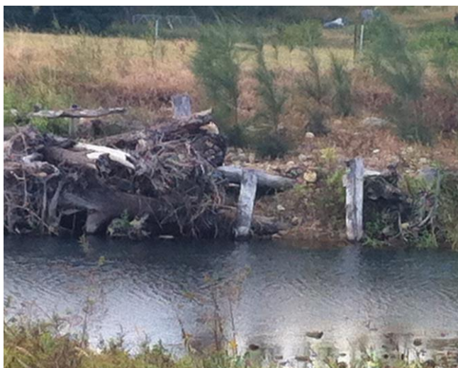
Image: Log Jam structure and Reveg Plantings

March 2015 marked the official end of the Owens Creek Log Jam project, however an extension was granted until January 2016. The extension utilises remaining funds and will allow for continued maintenance of the revegetation component of the site.