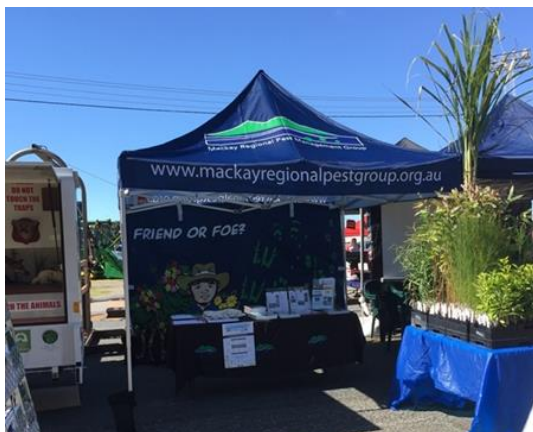
Image: PCL stand at Ag Trade Life 2015

The event was a great opportunity to distribute information relevant to property owners including weed flyers and brochures. Discussion with property owners involved weed management, particularly Giant Rat's Tail.