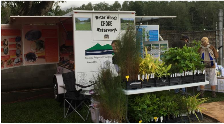
Image: PCL and MRC stall at the Pioneer Valley Show 2015