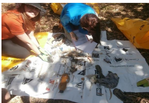
Image: Rubbish sorting