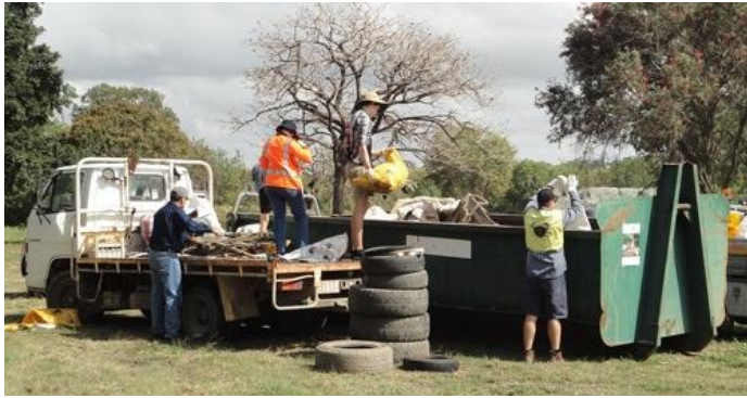
Image: Rubbish collected during the Great Northern Clean Up 2014