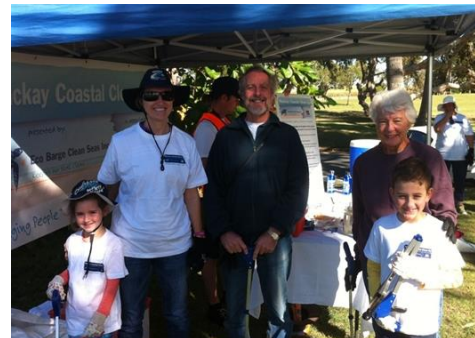
Image: PCL volunteers at the Eco Barge Clean Up 2014