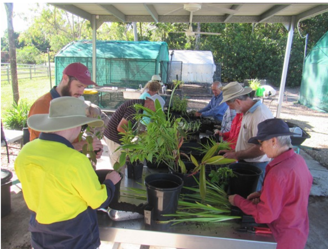
PCL volunteers potting plants

Field work included seven visits to Far Beach for weed maintenance including a planting morning. Over ninety hours of weeding resulted in an impressive amount of weeds removed from site. The same enthusiasm and care for the environment was brought to PCL's revegetation site at Reliance Creek, where roughly 35 weed bags of Ruellia simplex were removed in just three site visits. PCL volunteers would have also been seen in a number of landcare activities, including: National Tree Day and National School Tree Day at Lagoons Creek, Lambert Beach plant salvage, and the 2016 Great Northern Clean Up.