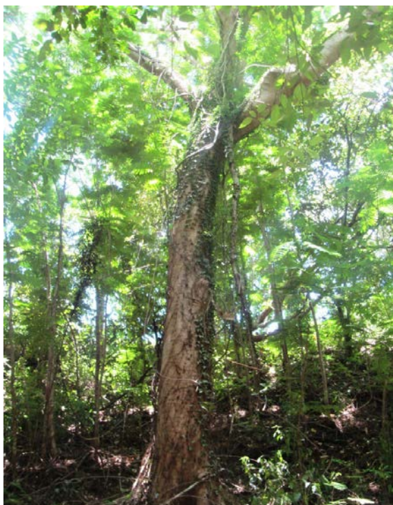
Cat's Claw Creeper Vine treated at the Sandy Creek site.

The key purpose of this project was to undertake treatment of the Cat's Claw Creeper (CCC) bordering Reliance Creek, targeting a minimum of 4ha of infestation. Outcomes from this project assist with the development of future strategic efforts for the management of CCC in the Mackay region.