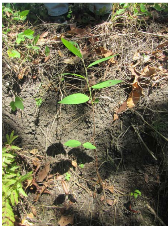
A small Pond Apple sapling located during the November 2016 surveys.

A case study outlining the history and treatment of pond apple in the Mackay region was developed as part of the project. It outlines key dates since pond apple was discovered in the region back in 2008 and the outcomes that the project has achieved during that time. The case study can be found on the Reef Catchments website.