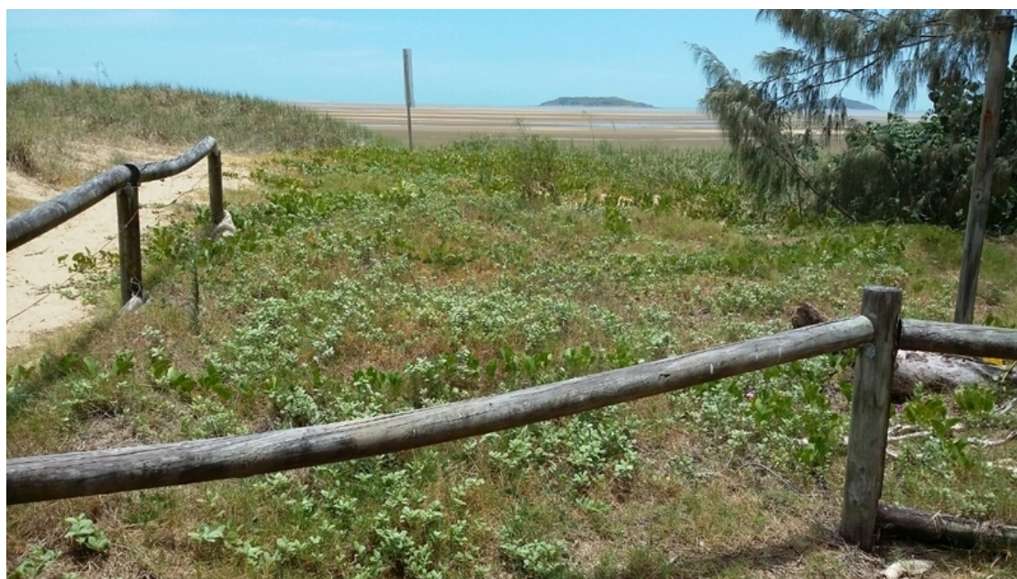
2015/2016 Far Beach revegetation site.

The National Landcare Programme project supported revegetation works at Far Beach. In the previous financial year 500 coastal groundcovers and trees were planted by PCL volunteers to help protect the Far Beach coastal dune system. Weed maintenance and watering continued through to November 2016. Revegetation at the site was very successful and PCL have continued to build on these great outcomes in the 2016/2017 Far Beach project.