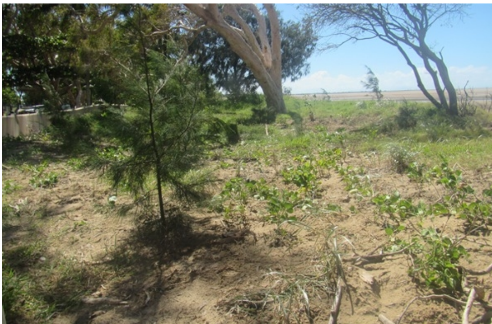
Coastal groundcovers at the revegetation site surround a juvenile Casuarina tree

PCL volunteers conducted weed maintenance over a 600m stretch of fore dune at Far Beach including the previous revegetation sites. Over the course of ten visits, PCL volunteers spent an estimate 92.5 hours removing target weeds Cenchrus echinatus (Seaforth Burr), Macroptilium atropurpureum (Siratro). A cleared section of Seaforth Burr at the southern end of site was replanted with a mix of coastal groundcovers including: Spinifex sericeus (Beach spinifex), Ipomoea pes-caprae (Goat's foot), Vitex rotundifolia (Beach Vitex) and Vigna marina . A photo point was established and reporting of works was completed through an online data application.