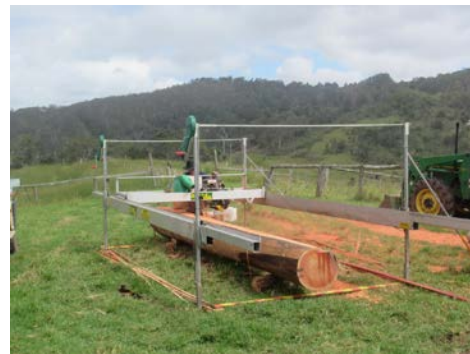
Lucas sawmill demonstration at the Eungella field day.

In April 2017, Reef Catchments held a farm forestry field day at Di William's demonstration site. The event was attended by stakeholders from across the Mackay Whitsunday region. Topics covered included remnant vegetation and property planning, forestry management techniques, the ABCD framework for both plantation forestry and native forestry management practices, challenges surrounding forestry and the potential of forestry in our region. Attendees were also able to witness and learn more about tree felling and mobile saw milling. Mobile milling is a great option for small scale forestry practices as it gives landholders the opportunity to mill their own timber onsite, saving on the cost of transporting felled timber to and from saw mills. The field day was then followed by a forestry working group meeting. The forestry working group and PCL have continued to be involved with this project and provide ongoing support and advice.