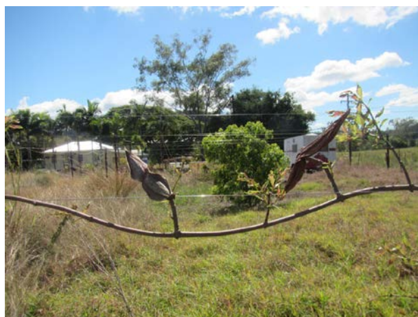
Mature Rubber Vine seed pods almost ready to burst open. The vine was found growing in an orchid.

Results from the 2015/2016 financial year Rubber Vine project identified more extensive outbreaks than originally anticipated in the Pioneer Catchment. A two-month extension project was granted through Reef Catchments to help further identify any areas of concern in the Mia Mia and Eton/Brightly areas of the Pioneer Valley. Survey work focused on locating new outbreaks and possible connectivity between known outbreaks and neighbouring properties from Mia Mia through to a property located at Kinchant Dam.