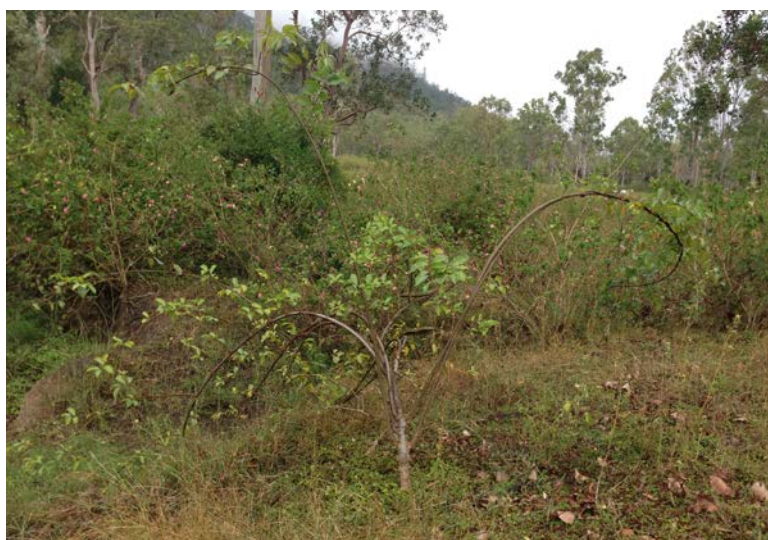
Rubber Vine located and treated during the May 2017 survey. The plant was mature enough to produce seed pods.