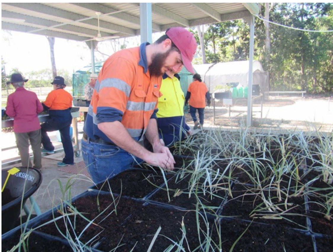
Beach spinifex coastal tiles are made using spinifex cuttings and a coastal soil mix