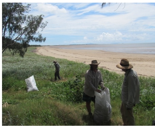
Beach views while the team removes weeds