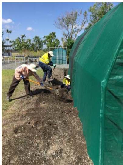
Green Army backfilling after the shade cover has been refitted.