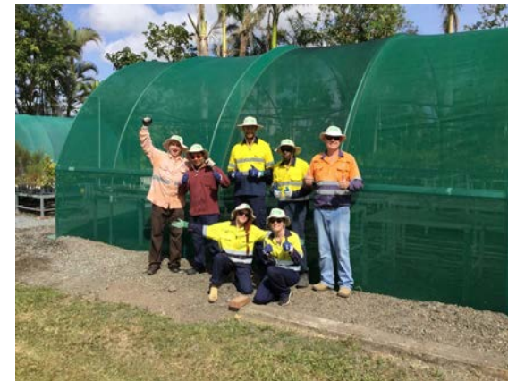
The Green Army—the champion team.