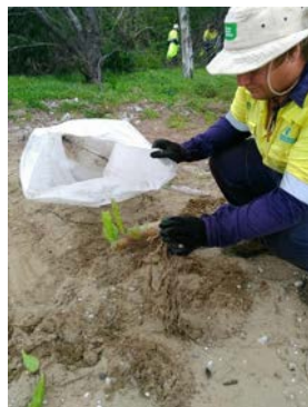
Young Prickly Pear being removed from the dune.