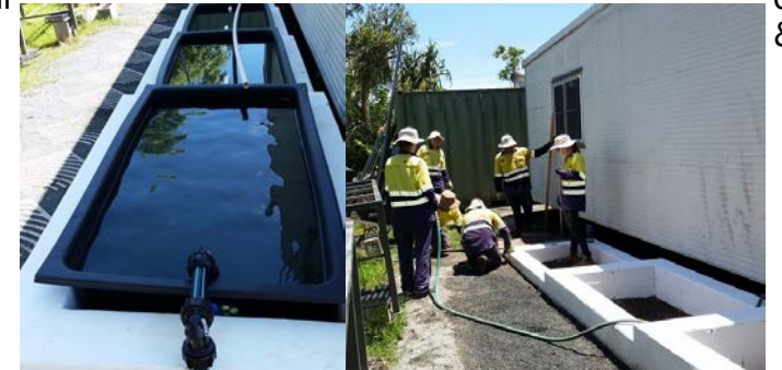
Right & above: The treatment train at the nursery

Workplace Health and Safety: All new volunteers are provided with safety inductions and training in the use of equipment and resources for all volunteer activities. Risk assessments and safety management plans are prepared for all events of the nursery site. Personal protective equipment for staff and volunteers is provided or required as a condition of participation in our projects and activities. First aid kits are upgraded regularly and tools etc. are maintained in good condition for staff and volunteer use. Galbraith Creek Riparian Project has received the benefit of last years funding from Landcare Australia. WCL's 2 volunteers who obtained their ACDC Commercial Operators Qualification for the management of weeds and safe handling of chemicals have been busy, regularly visiting Galbraith Park to undertake maintenance of the site. This is an asset to WCL as it enables qualified volunteers to supervise other volunteers during weed maintenance events and frees up our Landcare Officer to undertake other projects.