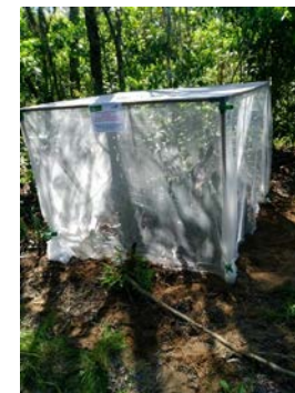
Fully installed breeding enclosure for the Cactoblastis biological control.

Cairns Birdwing Butterfly Project- This project was a follow up on the previous years project so all landowners were recontacted and advised of success of last project and to ask for continued access along creek lines for access for control. WCL Project Officer and Green Army hand removed Aristolochia elegans from the Mango Block and creek line at base of slope.