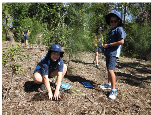
Students planting tube stock at Galbraith revegetation site