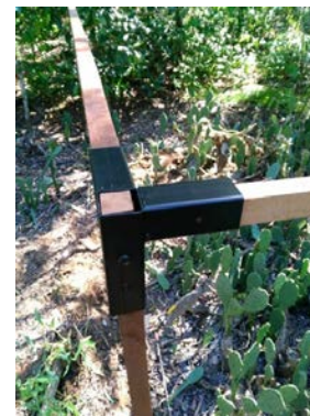
Frame of the Breed enclosure placed over Opuntia sp. Prickly Pear