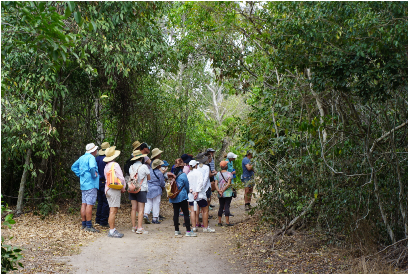
Why we do what we do, Nelly Bay Littoral Rainforest—Eco Walk—part of the Whitsunday Catchment