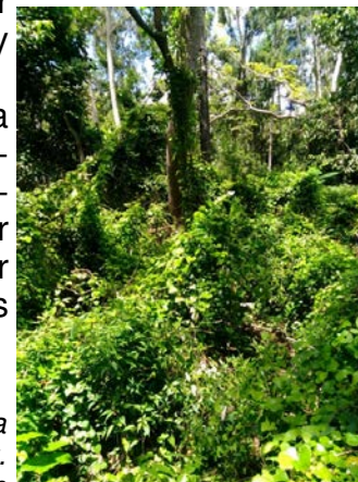
Right: Aristolochia elegans overgrowing forest.

Madeira vine was also recorded at the site so the Green Army was able to release Madeira Vine Biocontrol. The Green Army repeat weeded the Mango Block and creek spray the vine below houses, plant out 40 Native Aristolochia acuminata Vines. WCL Project Officer continued survey 5kms past the end of last year's survey along Silver Creek as far as was possible. No further vines found. WCL contacted 2 further landowners down stream who had not seen the vine this far down the creek. Public brochure edited, produced and distributed to nurseries and notice boards in Proserpine. Survey for Historical Sightings from Excel spreadsheet supplied by Herbarium. 5 further spraying events in Upper catchment to combat regrowth and spray new vines. 168 hours in-kind from Green Army team Over 100ha was surveyed in vehicle and in foot for this project & over 90 hours on ground activities.