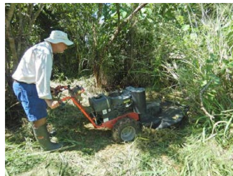
WCL Volunteer beating the weeds along the creek bank at Galbraith Creek