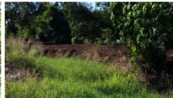
Mulched area along the creek bank in the last section to be revegetated at Galbraith Creek

In November 2017, Project Officer and 11 Green Army members surveyed and controlled CCC in an area upstream of Myrtle Creek Crossing. This area totalled 6.4 ha. All vines running up trees were cut/swabbed with 50/50 Glyphosate/ water, and the ground vines were foliar sprayed with Glyphosate 1/100 + wetter.