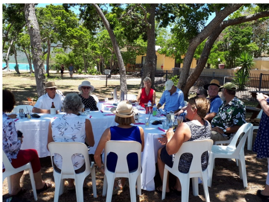
Left: Volunteers enjoying the Christmas party at Cape Gloucester Eco Resort