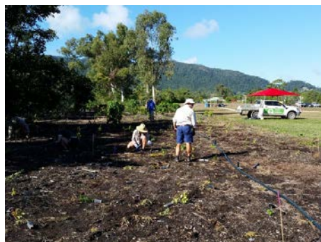
WCL Volunteers planting at Galbraith Park— National Tree day in July 2018