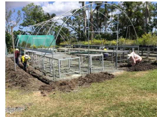
Green Army & WCL volunteers digging out the trench that anchors the shade cover