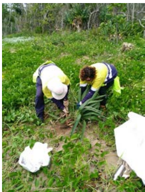
Green Army participants removing Yucca plant within the dune at Conway Beach

The breeding enclosure for the Cactoblastis biological control of prickly pear has been established and is functioning well. An area densely infested with Prickly Pear is covered with a rectangular netted enclosure and all other insect removed for within the net. Prickly Pear cladodes with egg “sticks” cactoblastis grub are pinned to the unaffected plants and when the grubs hatch they eat their way through the inside of the cladode. The exclusion of other insects by the netted enclosure allows the Cactoblastis to live through its life cycle, laying eggs that infest all of the plants within & build “supply” of the Cactoblastis biological control, that can be removed & relocated at other prickly pear infested sites such as at Swamp Bay. The aim of the project is to build sufficient numbers in the local area that they will breed on their own and spread naturally. This has been successful enough to have to move the current enclosure as the Cactoblastis biological control was running out of food source as the Prickly Pear plants within have died.