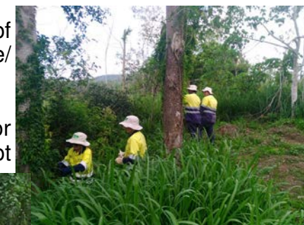
Above: Green Army controlling Cats claw creeper.

A further survey of area controlled in May/June 2018 showed that the control was not successful and vines were again growing up trees. An area downstream on both sides of the Proserpine River was surveyed to find the extent of the infestation.