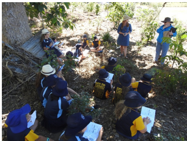
Students complete their work sheet in the shade at Galbraith park

Reef Guardian Future leaders challenge- 54 students and six teachers from five of our Reef Guardian schools -Cannonvale State School Whitsunday Christian College, Proserpine State School, Hamilton Island State School, St Catherine's Catholic College, Hayman Island School, in the Whitsunday region attended this event. Reef Guardian partners—Eco Barge Clean Seas, Whitsunday Catchment Landcare, Whitsunday Regional Council, Reef Catchments, Whitsunday Local Marine Advisory Committee & Day Dream Living Reef delivered informative and interesting activities. Students caught the bus to Galbraith Park to undertake a guided walks through the revegetation to learn about the importance of trees in the landscape, in our environment, in our culture and in our everyday lives generally. And site specifically, how the revegetation at the Galbraith creeks has improved quality of water entering the Barrier Reef through riparian revegetation at Galbraith Park. Student got to plant about 120 native seedlings and collected seed from the areas of more mature vegetation that was propagated later at the Community nursery.