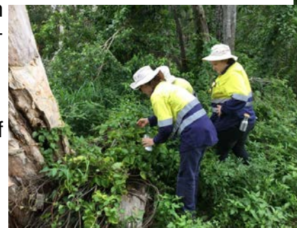
Left: Green Army releasing biological control early on 2017.