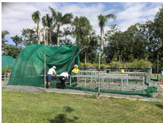
Green Army & WCL volunteers dismantling to old shade house.

We thank the Green Army participants & Supervisor very much for undertaking this project. It has ensured that we can continue to produce the plants that are use in the a variety of project & continue to provide a source of funding for WCL activities.