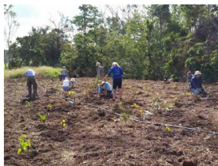
WCL Volunteers planting at Galbraith Park— National Tree day in July 2017