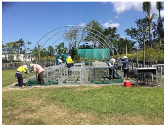
Green Army & WCL volunteers assembling the frame of the new shade house