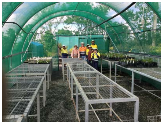
Green Army & WCL volunteers—job done & new seedling trays in the shade house.