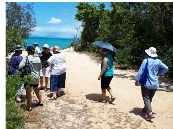
Right: Volunteers collecting seed & enjoying a walk before the Christmas party