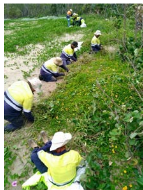
Green Army removing Singapore Daisy -hard at work at Conway Beach