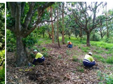
Above- Green Army participant weeding Aristolochia seedlings.