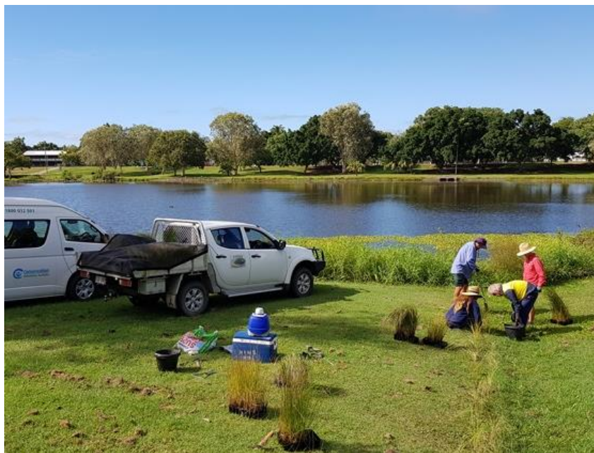
The first planting with the PCL volunteer team.