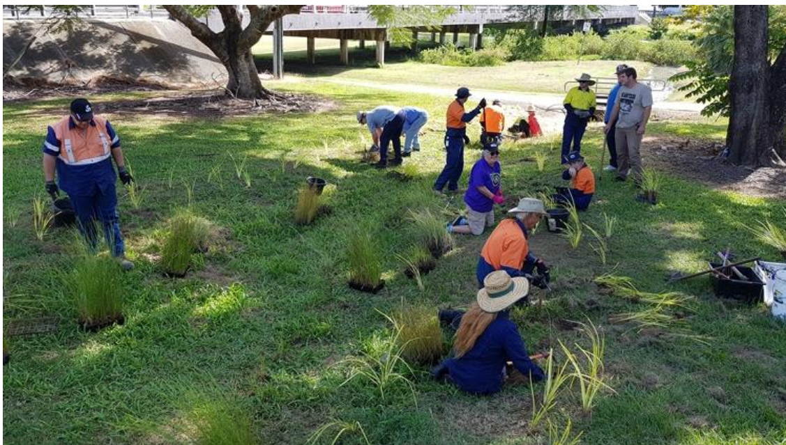
National Volunteer Week planting event at the Gooseponds.

In May 2018 PCL hosted a planting event and BBQ at the Gooseponds as a thank you to our wonderful volunteers during National Volunteer Week. In a great show of team work and determination, the volunteers managed to plant 600 plants in a three-hour period in unfavourable rock-hard ground. The amazing lunch spread made the effort more than worth it and it was a great end to a good day.