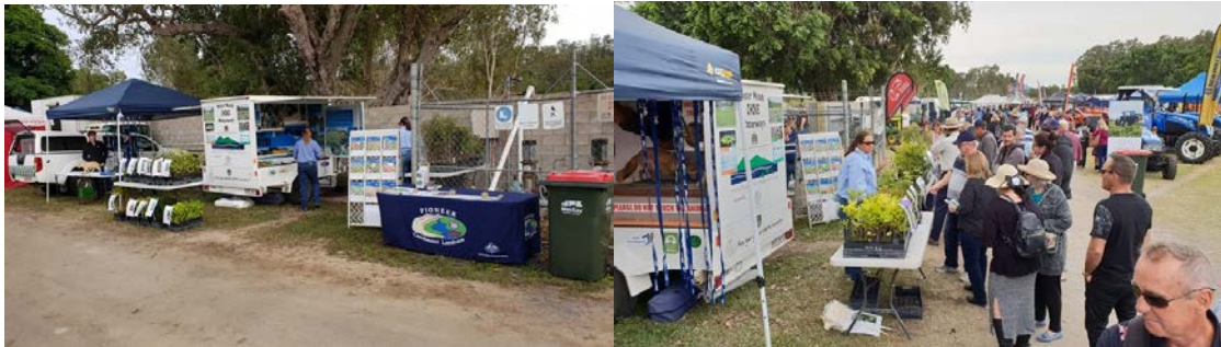
The stall at the Valley Show (left) and the crowd two hours later (right).