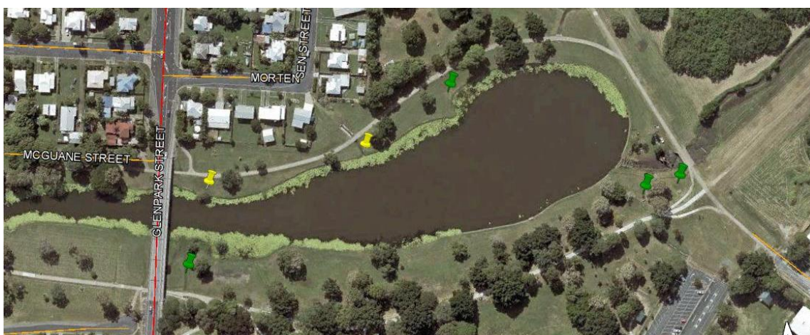
This map of the work area shows completed sites with green pins and planned sites with yellow pins.