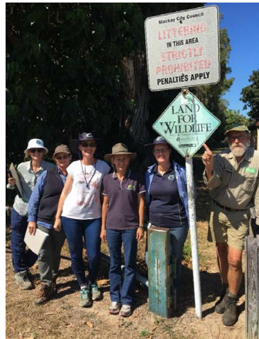
LFW field visit to Morag McNichol Reserve