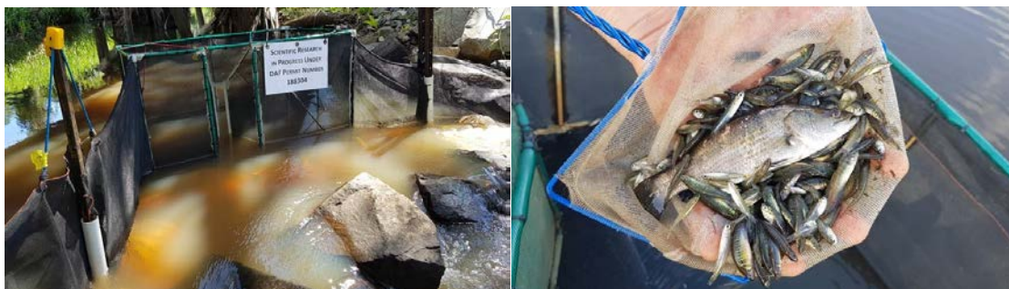
The fish trap at the top of the fishway at Fursden Creek (left) and a juvenile barramundi at the top of a net full of fish (right).