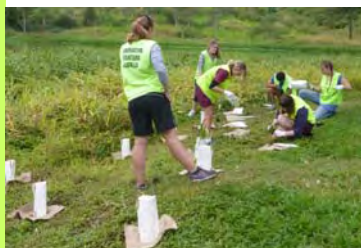
CVA & SSSHS planting at Middle Ck Dam

The aquaponic units installed at Middle Creek Dam during the previous project; Monitoring and remediation of blue green algae outbreaks in coastal ecosystems (funded by Australian Government, Community Coastcare) are now being removed due to the conclusion of the current project. Monthly ambient water quality monitoring by our Healthy Waterways volunteers will continue.