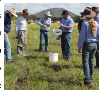
Bringing landholders together at the Dung beetle Paddock walk