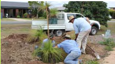
Conservation Volunteers Australia & SLCMA volunteers plant the Grasstrees

We have introduced more local native plants to the gardens, sourced from a combination of our very own SLCMA Community Nursery and Society for Growing Australian Plants. We were fortunate to be donated 12 mature Xanthorea sp. (grasstrees) from BMA HPX – these are now providing a lovely feature in the coastal garden and entrance to the walking track.