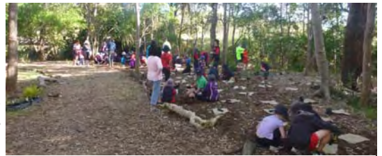
Alligator Ck School revegetating their local creek bank

SLCMA continues to provide support to our local schools, conducting school activity days, offering technical advice and plants for onground projects as well as assisting teachers and students with resources and information. SLCMA has received funding from various sources to make this possible ( see below for details ). However a special mention to Mackay Regional Council, Natural Environment Program through the Landcare Support Project which gives SLCMA the foundation to provide an initial of 10 days support to local schools per year. Some highlights of the year include: