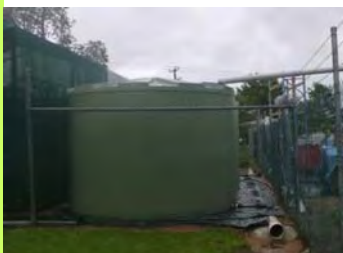
One of the water tanks installed

Two years ago, we received permission from Mackay Regional Council to expand the nursery area to incorporate an undercover area for our volunteers and space for water tanks and more benches. We are happy to say that things are certainly progressing. This year we were successful in obtaining funding through Mackay Regional Council Natural Environment Program for the purchase of 2 x 15,900L and 1 x slimline 3,000L water tanks for the SLCMA Community Nursery. Once fully installed, these will allow us to utilise rain-water captured off nearby sheds and reduce our usage of town water. Our next step is to construct new nursery benches and give the old ones some much needed TLC, as well as re-surfacing of the nursery area.