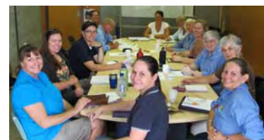
Members of CQCLN doing governance training with Wombat Creative