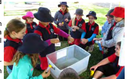
Alligator Ck students learn the River Story

Landcare Week celebrations (Sep 2013) Three local schools, who are active Landcarers; Alligator Creek and St Annes Primary Schools and Sarina State High School had the opportunity to meet Costa Georgiadis (host of ABC’s Gardening Australia) during Landcare Week 2013. Students, teachers and parents were inspired by discussions around vegetable gardening, companion planting, importance of biodiversity and sustainability, using recycled materials, integrating chooks into gardening systems and gaining general advice and inspiration for their future activities.