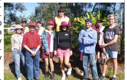
SSHS students & work experience student in the Sarina Community Native Gardens