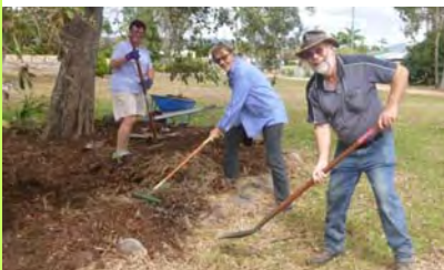
"Friends of the gardens" mulching

The walking track has been completed with the construction of the concrete boardwalk across the main in-flow of the seasonal wetland and the installation of stepping stones at the minor in-flows; allowing all weather access along the path. A big thankyou to BMA Hay Point services who donated the boardwalk material.