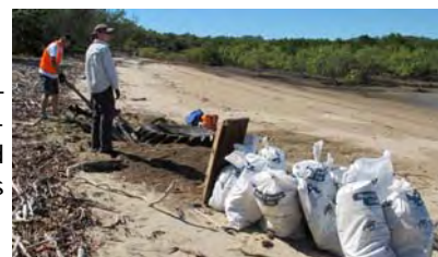
Rubbish collected at Freshwater Point Beach, during the Sarina Coastal Clean Up