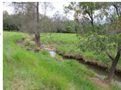
Before & after: Riparian fencing to restrict stock access and protect waterway

We have begun to support our 'equine landholders' this year, through regular equine Landcare articles submitted to the Breakaway Horse Riders Club—we hope to extend this to other horse groups in the future.