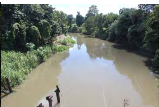
Below: 2013 wet season

The 3 sites monitored along Plane creek capture a mixture of landuses from Forestry/horticulture in the upper catchment, cane in the middle catchment and urban/industry in the lower catchment.