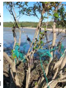
Marine debris, a common site in mangroves