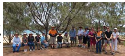
Participants enjoy a break at Grasstree Beach during the Coastal Field Trip

The Sarina Community Coastcare Program is supported by BHP Billiton Mitsubishi Alliance—Community Partnerships Program and was completed on 30 June 2013. SLCMA will still endeavour to work with stakeholders and project partners to assist local residents and other community groups to protecting our coastal environment.