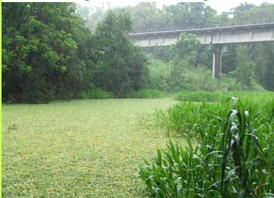
Above: 2006 water lettuce infestation