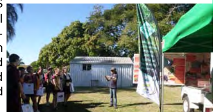
SSHS Career Expo