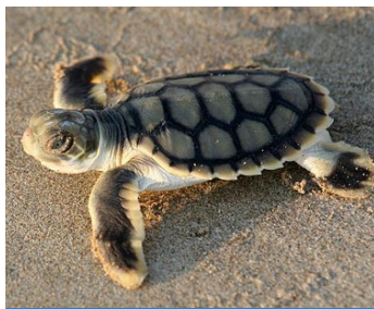
FLATBACK TURTLE HATCHLING