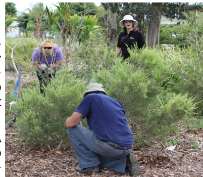
SLCMA volunteers maintaining the Sarina Community Native Garden

The team of volunteers play an integral role in the successfulness of SLCMA Community Nursery processes from the collection and cleaning of seeds to growing on the seedlings and assisting with the nursery expansion. SLCMA volunteers also have a large role to play in the continued development and maintenance of the Sarina Community Native Gardens. SLCMA has welcomed many