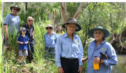
SLCMA volunteers participating in a Seed Collection excursion along Plane Creek

new faces (young and old) into the volunteer program this year and a huge thank you goes out to the long term volunteers who have generously taken the time to mentor the newcomers.