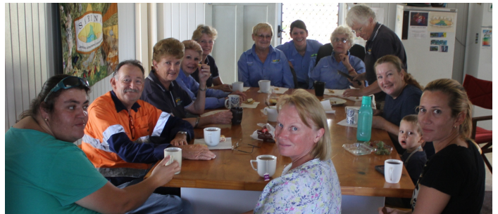
SLCMA volunteers enjoying a hard earned morning tea

The SLCMA Community Nursery continues to operate as a training facility for volunteers, students and trainees to learn about general nursery practices, hygiene and native plant propagation. The number of native plants propagated and supplied for local revegetation projects, environmental awareness events, Landcare members, landholders and schools has increased this year as demand grows for increased local biodiversity and bush food plants.