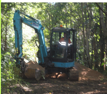
Left: Re-instatement of the walking track July 2014

SLCMA is focussed on improving the Plane Creek Revegetation site and has been working closely with Mackay Regional Council and Conservation Volunteers Australia to conduct onground activities at the site. Project activities have included the re-installation of the walking track, community seed collection trips, weed control and planting activities. The project is funded through Whitsunday Catchment Landcare, via Department of Environment and Heritage Protection—Everyone's Environment Grant 12/13.