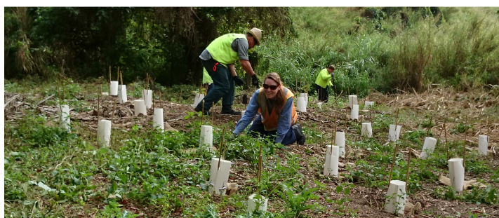
Right: Conservation Volunteers Australia conducting weed control and planting activities at Plane Creek Revegetation site