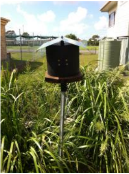
Native Bee hive installed at SLCMA

Funding under the Dalrymple Bay Coal Terminal 2015/2016 Community Sponsorship program has enabled two projects to commence. Those being Nursery optimisation upgrades and Community Engagement Events. The Nursery Optimisation upgrades have enabled the purchase of new ergonomic potting benches, a soil holding bay, along with a slim line storage shed, yet to come are additional sun hardening benches.