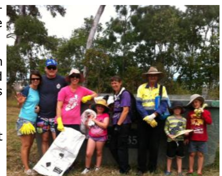
Great Northern Clean up volunteers!