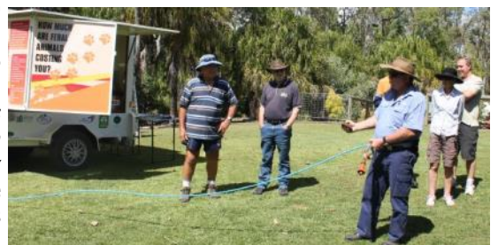
Weed control training day

To date, the project has supported 150 landholders with properties (ranging in size between 2 and 50 acres) and provided 6 landholder training days across the region. The Building Resilience of Natural Areas and Sustainable Land Management on Small Properties within the Mackay Whitsunday Region is funded by the Queensland Government's Everyone's Environment Grants.