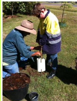
Volunteers Planting Whitsunday Bottle Trees for National Tree Day

The establishment of the Sarina Community Native Gardens is well under way with many of the plants flowering and fruiting and providing habitat to a variety of native birds and other wildlife. Over the last six years, we