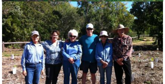
Above: Volunteers seed collecting