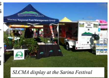
SLCMA display at the Sarina Festival