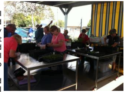
Volunteers utilizing the new work benches

by DBCT PTY is holding an event focused on sustainable gardening.