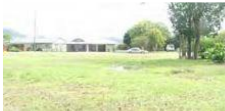
Expansion of the wetland (2015)

In 2009 we began the journey of transforming an area of lawn adjacent to the SLCMA Office, into the Sarina Community Native Gardens. The purpose of the gardens is to demonstrate and promote the use of native plant in gardens and landscaping situations as well as provide an educational opportunity for locals & visitors to learn about local native plants, their benefits & uses in various situations.