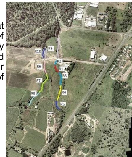
Galbraith Creek Revegetation . PHOTO: Google maps