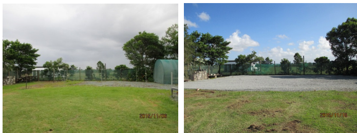
WCL Community Nursery site improvements.

Selection of environmentally focussed books for sale. WCL has a good selection of books available for sale from the nursery. Some of the topics covered include: plant & weed identification, weed control, native animals— birds— reptiles and insects. We even carry some lovely children's books that all have an Australian focus.