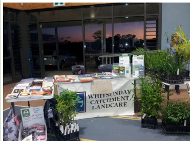
WCL information stall at St. Catherine's College Night market.

Sustainable Land Management, Weed identification, Control & Landholder Legislative Responsibility information available at community events- Attendance at Show Whitsunday, Nature Celebration Whitsundays, Uniting Church Flower Show, St. Catherine's College Annual Night Markets. Thank you to Whitsunday Regional Council for allowing us to erect our stall along side their Pest Control trailer. This provided a great opportunity to present a diverse range of information about management of pest plants & animals. The mounted wild pig & wild dog heads always attract attention.