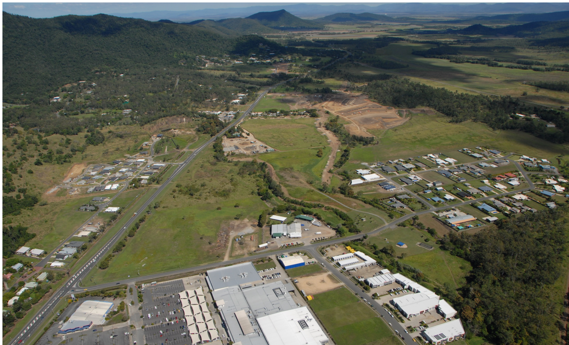
Why we do what we do— part of the Whitsunday Catchment with Galbraith Park in the centre