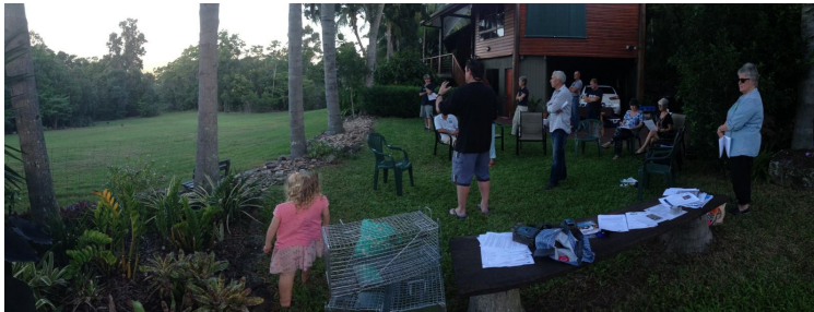
Feral Cat Monitoring Project– At a community engagement event -just on dusk a Proserpine Rock Wallaby came out onto the lawn & that is what we are all looking at.

In the last 3 years WCL has undertaken contract work for three local organisations. Reef Catchments, Whitsunday Regional Council (WRC) and St. Catherine's College. This contract work has enabled WCL to earn small profits, which has in turn, been spent on activities untied to external grant obligations such as our volunteer, school and community engagement activities. Contract works in 2015-16 has included: Endemic Plant supply– 8500 tube stock for System Repair projects; Weed control- Pond Apple, Rubber Vine, Itch Grass, Giant Rats Tail Grass, Mimosa pigra, Prickly Pear; Feral Pig Control program– administration tasks; Case Studies & Field events- Fish tagging & Feral Cat Monitoring; Revegetation Planting & Maintenance– Galbraith Park Creeks; Revegetation Project signage-Galbraith Park; Prickly Pear Weed Control & revegetation– Conway Beach. Pond apple Survey & control; Priority Pest Mapping Survey & Twin Creeks Riparian Revegetation, Plant supply for WRC projects.