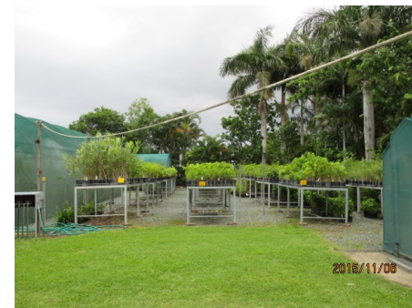
WCL Community Nursery

Selection of environmentally focussed books for sale. WCL has a good selection of books available for sale from the nursery. Some of the topics covered include: plant & weed identification, weed control, native animals— birds— reptiles and insects. We even carry some lovely children's books that all have an Australian focus.