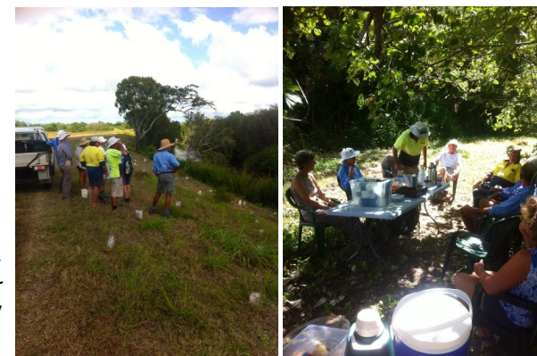
Volunteers inspecting a RC Systems Repair revegetation site & having morning tea on the O'Connell River

Undertake regular site visits by volunteers for endemic seed collection & planting. As part of our volunteer events program we endeavour to provide a regular alternative to the volunteer mornings at the community nursery. Volunteers visited all of our revegetation sites— Galbraith Creek, Cannonvale Beach, Conway Beach, Council reserves at Dingo Beach, Nelly Bay and private property on the O'Connell River to collect seed or undertake plantings. Many of our volunteers also collect seed from their own properties as well. These events enable WCL to collect a wide range of provenance seed and produce the native plant species that we provide for replanting into the diverse regional ecosystems that we have in the Whitsundays.