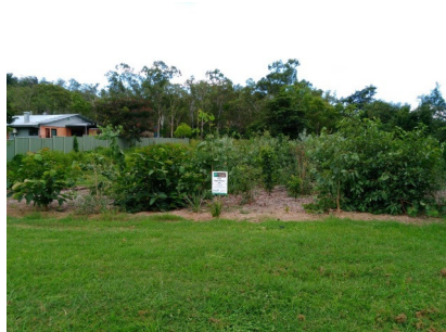
25th Landcare Anniversary Revegetation growth -March 2016