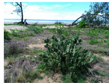
Opuntia stricta Conway Beach