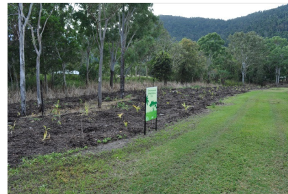
Twin Creeks Revegetation Project