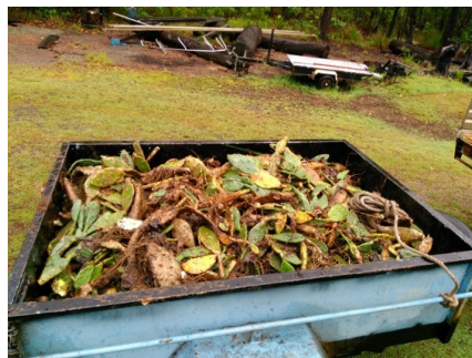
Just one of the 13 trailers full of Opuntia stricta removed from Conway Beach.