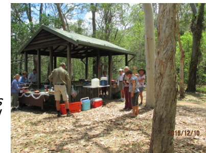
WCL Volunteer Christmas Party.