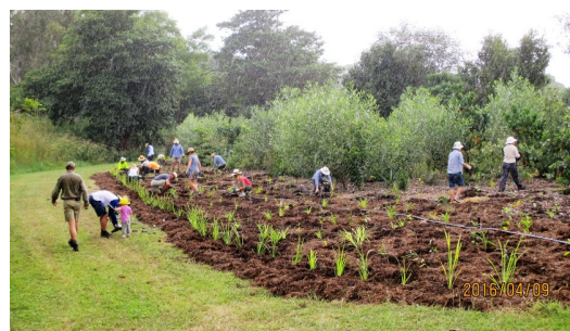
25th Landcare Anniversary Revegetation growth Even in the pouring rain our volunteers keep planting. April 2016

Coral Esplanade Foreshore Revegetation— This ongoing project was funded initially under the QLD Government's Everyone's Environment Program in 2014. WCL staff & volunteers visit the site to undertake maintenance of the planting site & monitor the outcomes. It is an very exposed site and weed infestation is a perennial problem. Even with the occasional vandalism of our plantings, we continue to have commitment to the project and it will remain on our project list for a few years to come.