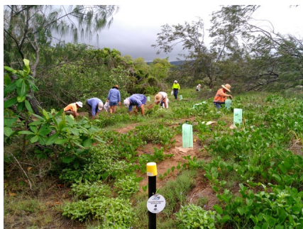
Volunteers hard at work planting at Conway Beach

Conway Beach- WCL was contracted by Reef Catchments to undertake removal of Opuntia monacantha & Opuntia stricta (Prickly pear varieties) approx. 6500kg (13 trailer loads) of prickly pear was removed from the site— no mean feat for the brave souls that undertook the work— hats off to them and congratulations. It is evident that the impacts of cyclone & storm events assist the spread of prickly pear along the coast line by the “paddles breaking off and being washed up and buried by sand, then regenerating. Where the weed was removed, revegetation works were undertaken and a further 2.8ha surveyed for the extents of weed infestation within the foreshore reserve just north of the residential settlement Conway Beach.