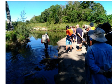
Fish Tagging & Fishway Field Event– O'Connell River.