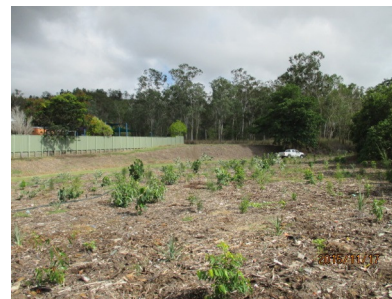
25th Landcare Anniversary Revegetation growth -December 2015