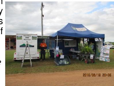
WCL stall & WRC Pest Trailer at the 2015 Proserpine Show.

Publications: Monthly Newsletter, Facebook Page and Website. WCL produces a monthly newsletter that we distribute to our members and many other interested people or organisations. We try to keep our Facebook page & website up to date. Keeping the website up to date has proved a bit difficult than the Facebook page or a social media challenged and time constrained coordinator, all I have to do is find the time & the interest in getting the training— I am working on it -Although a tech savvy volunteer would be a most welcome addition to our office ( only a couple of hours month.....)