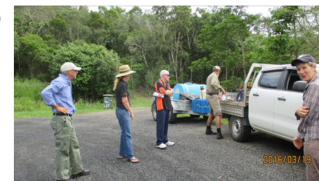
Peri-Urban project participants at the spray equipment training event.

Workshops & Training— WCL has hosted a Quick spray & splatter gun training event for Peri-Urban project participants to build the skills of landholders in the identification of weeds and the best practice management techniques for differing weed infestation types & landscape contexts. This event covers the use & operation of WCL's Weed spray Trailer ( also available for hire from WCL) mechanical controls Endemic Seed collection, processing & storage, plant propagation & nursery management.