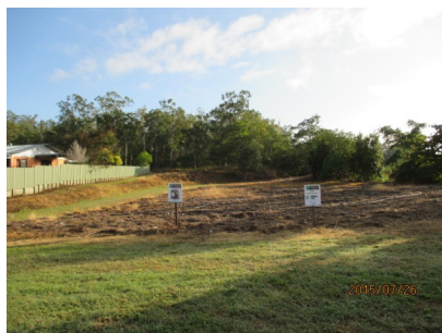
25th Landcare Anniversary site— Community Tree planting event July 2015.

Galbraith Creek Riparian Corridor- this year WCL staff, volunteers and the community planted over 2000 plants at the Galbraith Creeks. These activities were funded by grants—the 25 year Landcare Anniversary Grant and a Reef Catchments contract for 6 months maintenance of the site. Numerous visits by volunteers and two public community planting events (National Tree Day & Anniversary Celebration events) has seen the collection of 2kg of seed and plantings of endemic riparian plant species. The Galbraith Creeks Riparian Corridor Project has been running for since 2008 now and there have been 10000's of local native plants installed at the site. Thanks to the dedication of staff & volunteers this revegetation site is a real credit to our organization.